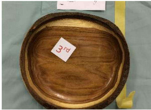
3. Grahame Tomkins