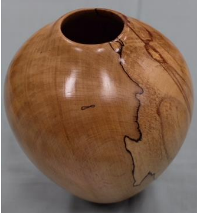
1. Les Clarke