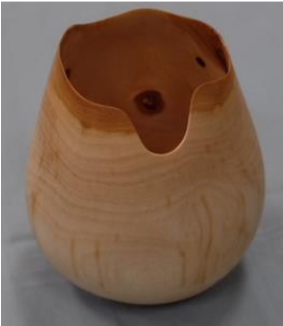
Sculpted Vase - Peter Hoare (7 Votes)